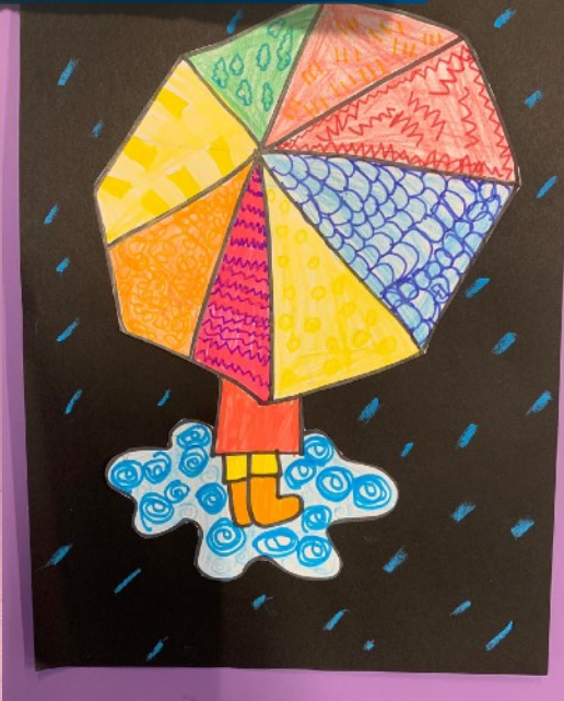
After a rainy day last week we decided to do some umbrella art. We each drew our own umbrella and person, then designed some patterns in felt, and shaded in with pencil.