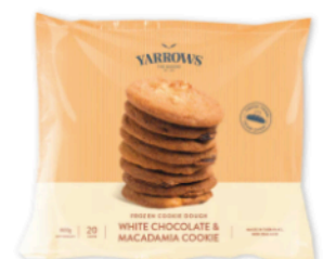
Yarrows White Choc & Macadamia Frozen Cookie Dough Pack of 20 cookies - 800g