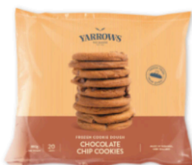
Yarrows Chocolate Chip Frozen Cookie Dough Pack of 20 cookies - 800g

We have sold over $10,000 worth of cookies!!!! Thank you so much for all of your support. Remember last day for orders is Sunday 3rd October