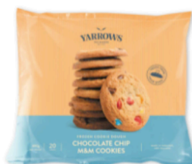
Yarrows M & Ms Frozen Cookie Dough Pack of 20 cookies - 800g