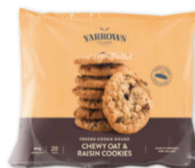
Yarrows Oat & Raisin Frozen Cookie Dough Pack of 20 cookies - 800g